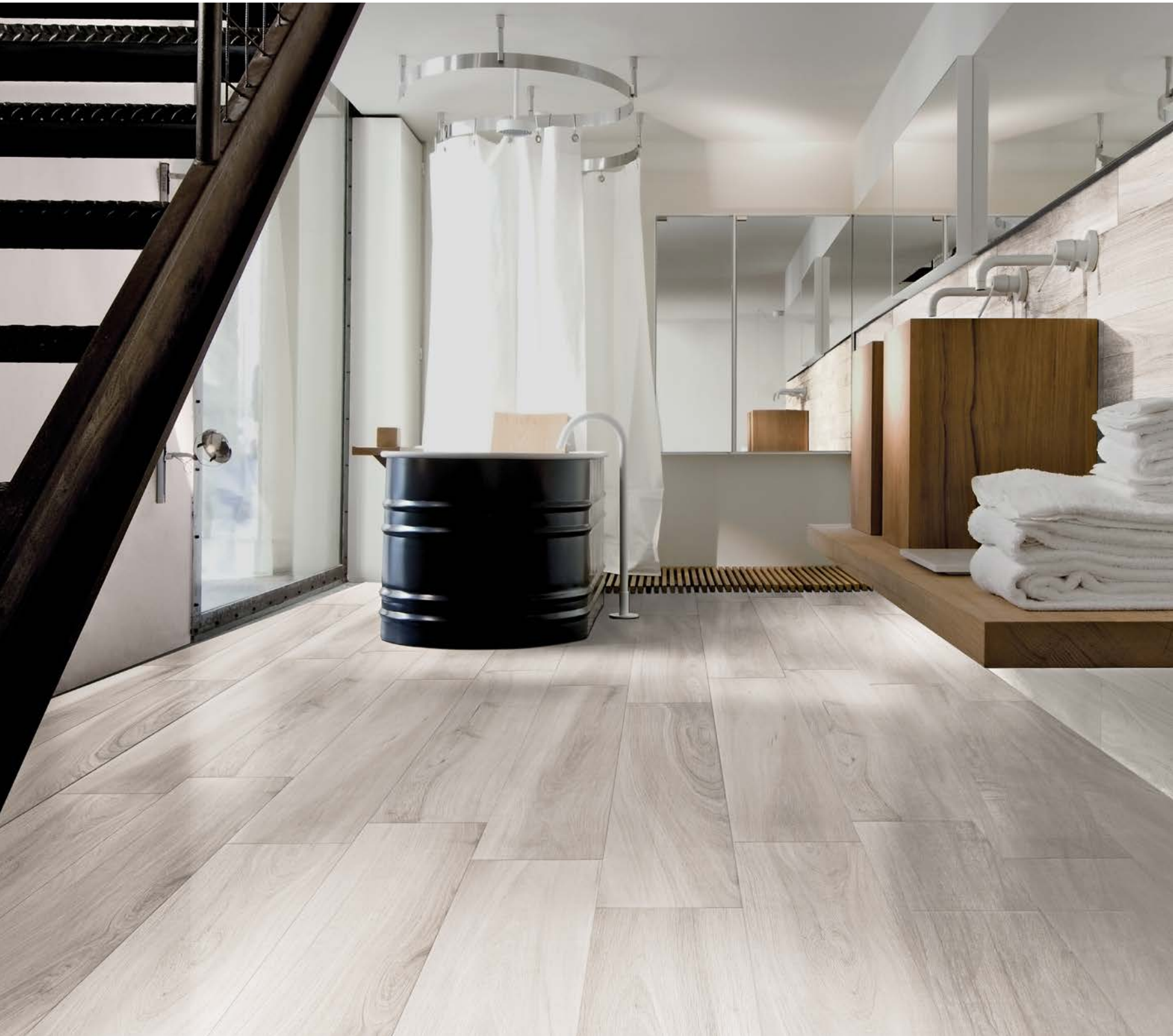
FLOOR: WHITE 20x120 WALL: WHITE 20x120