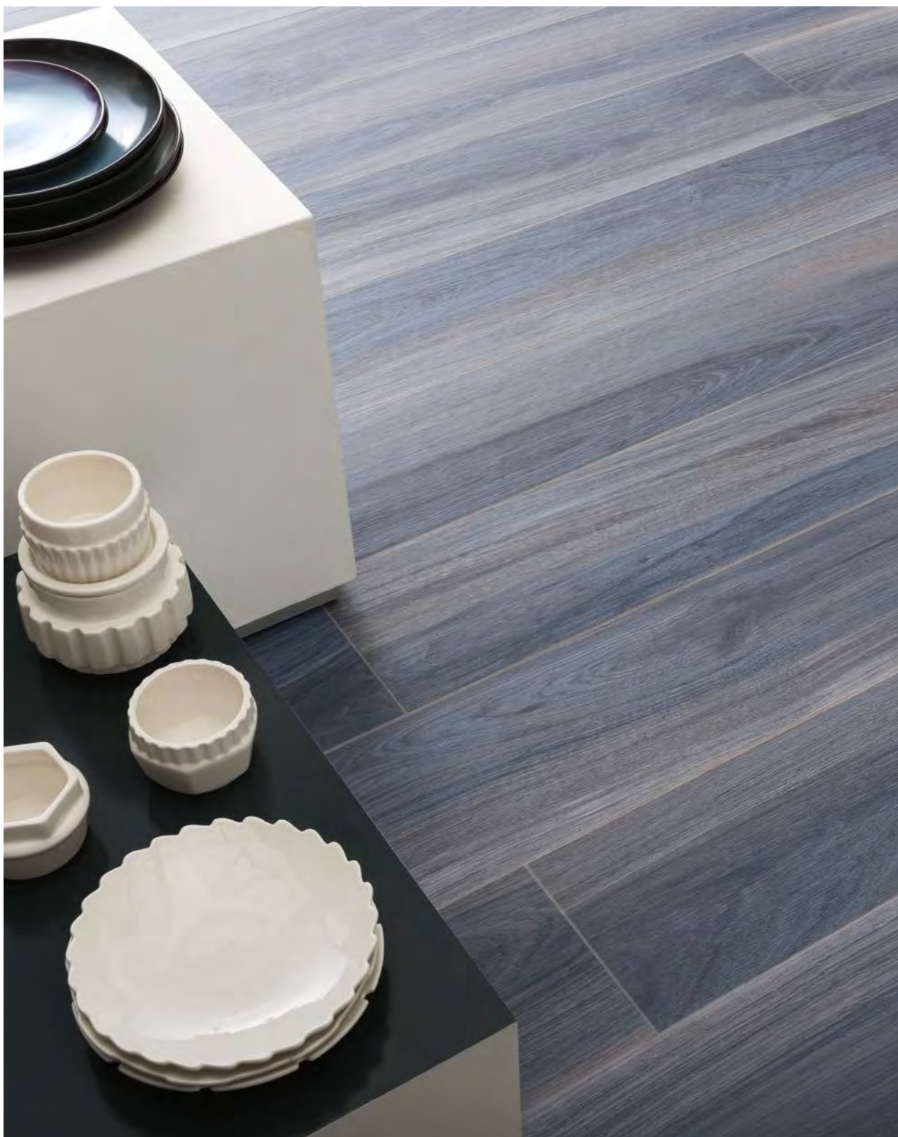
FLOOR: BLUE 20x120