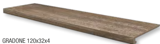
GRADONE 120x32x4 1.