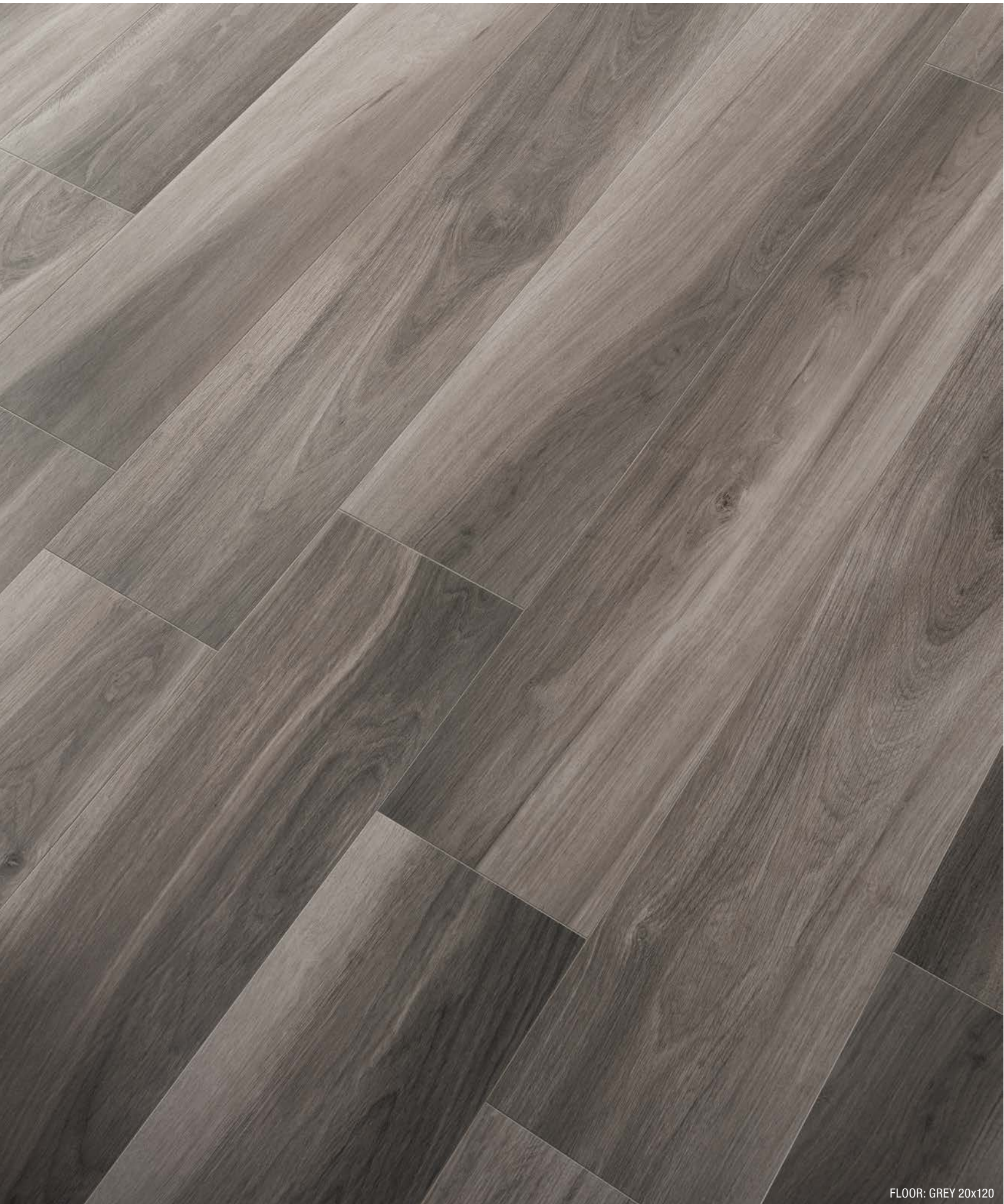
FLOOR: GREY 20x120